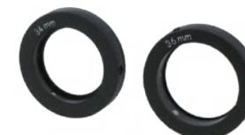
Middle wheel (34mm & 36mm)