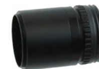
Eyepiece extension ring