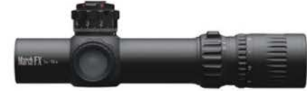
March-FX 1x-10x24 Shorty (34mm body tube)