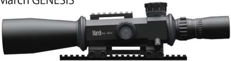
March-GENESIS High Master 6x-60x56G