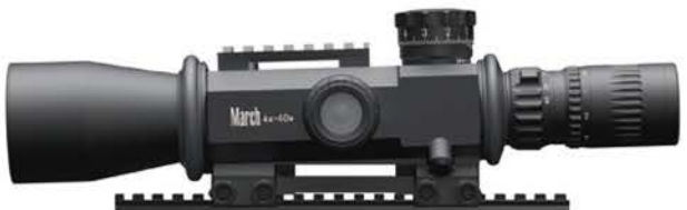
March-GENESIS High Master 4x-40x52G