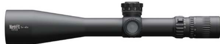
March-FX 5x-40x56 Gen2