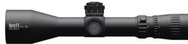
March-FX High Master 4.5x-28x52