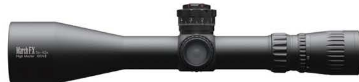
March-FX High Master 5x-42x56 Gen2